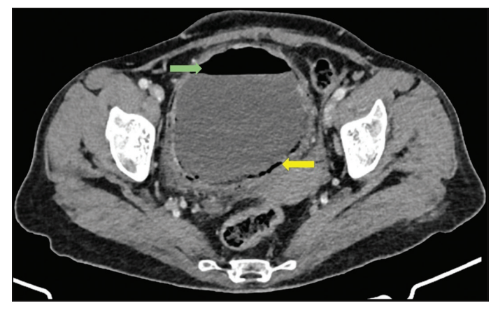
Figure 2: Gas in the bladder (green arrow) and gas in the wall (yellow arrow). Finding of computed tomography of the abdomen and pelvis in emphysematous cystitis

significant risk factors include diabetes mellitus (up to 80%), bladder outlet obstruction, recurrent urinary tract infections, neurogenic bladder, immunosuppression, female gender, and organ transplantation [3]. The most commonly isolated pathogens are bacteria, especially Escherichia coli (70–75%), which have the property of producing gas and generating carbon dioxide by fermenting the high concentrations of glucose in the urine and tissues of affected patients. By accumulating acid radicals that lower the local pH, the bacteria themselves, which have specific enzymes, can convert the acids into carbon dioxide [4].