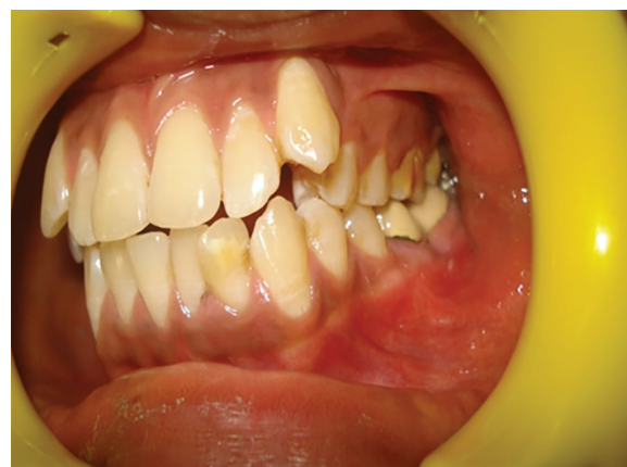
Fig. 10: Fixed prosthesis cementation with 36 and 37

adjacent tooth while removing the distal root. Debridement and irrigation of the socket along with thorough root planning of the mesial root was performed. Odontoplasty was performed to remove the developmental ridges, and the distal aspect of the mesial root was contoured in such a way as to facilitate the oral hygiene measures. Socket preservation was done by grafting the extraction site with "Perioglass" (GC America Inc). The buccal and lingual flaps were approximated to cover the graft. Sutures were given, COE pack surgical dressing was placed, and then the patient was dismissed with postoperative instructions along with antibiotics, analgesics, and chlorhexidine mouthwash (Figs 6 and 7). The surgical site was then allowed to heal with special consideration such that no occlusal stress was imposed on the mesial root of 36 for 4 weeks (Fig. 8). The patient was called again after 3 months. Radiograph revealed good bone regeneration, which indicated good uptake of the graft. Restoration of hemisected tooth was then planned with a fixed partial denture in relation to 36 and 37.