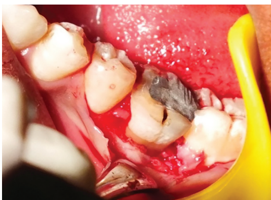
Fig. 5: Flap reflection with 36