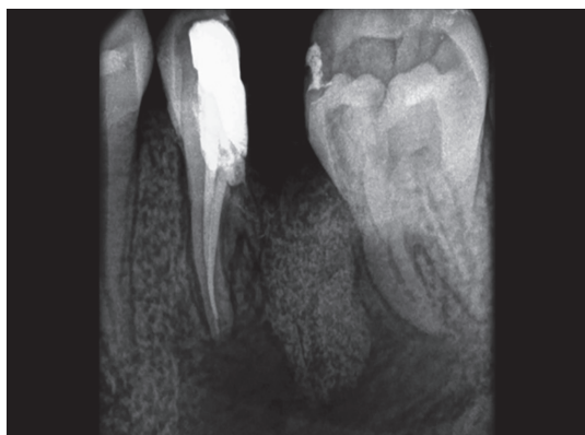
Fig. 7: Postoperative radiograph