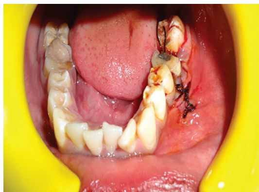
Fig. 6: Hemisection done with 36

wish to get tooth extracted, so a conservative treatment option was opted after taking an informed consent from the patient. The treatment procedure was carried along the following case.