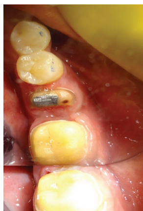
Fig. 9: Tooth preparation with 36