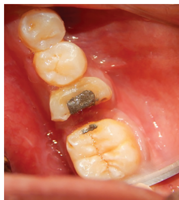
Fig. 8: Healing after 4 weeks