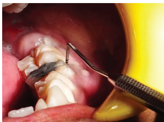
Fig. 4: Pocket in relation to distobuccal region of 36