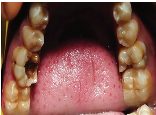
Fig. 1: Preoperative photograph showing distal caries with 36