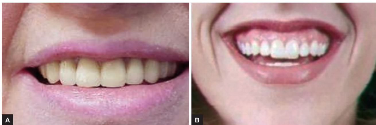
Figs 2A and B: Anterior tooth display in social and enjoyment smiles; note the difference in gingival show