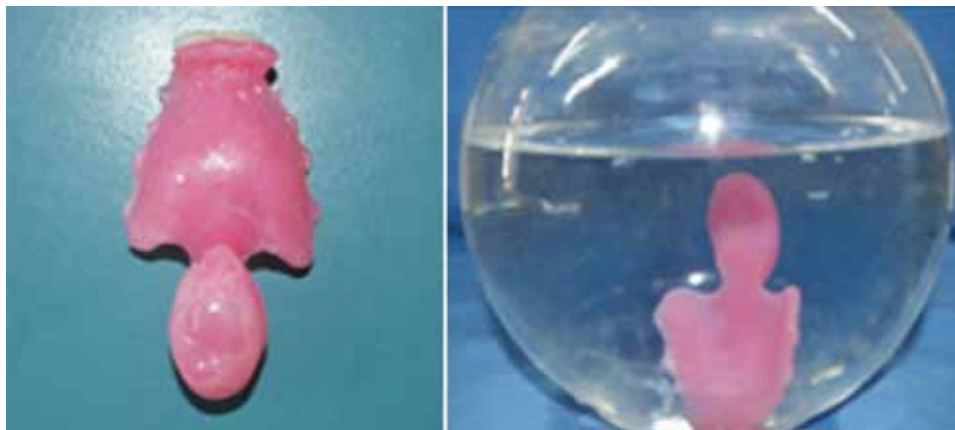
Fig. 7: Hollow speech aid prosthesis floating in water