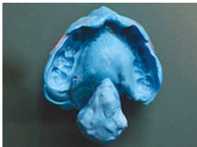
Fig. 3: Secondary or final impression