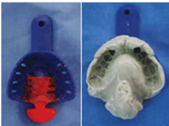
Fig. 2: Tray extension with modeling wax and primary impression