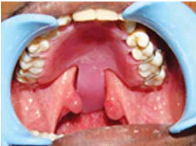
Fig. 8: Postinsertion of the prosthesis

Mumbai, India) in dough stage was adapted on the base of defect after that aluminum foil (Parekh Aluminex Ltd, Dadra (U/T), India) was placed over acrylic resin in the defect (Fig. 5). Packing and processing was done similar to conventional denture fabrication. Prosthesis was retrieved after deflasking. Aluminum foil separates pharyngeal part of prosthesis into a small lower segment