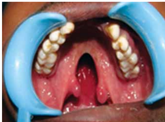
Fig. 1: Intraoral view (Pretreatment)

A 19 years old male patient reported to Department of Prosthodontics, Government Dental College and Hospital, Hyderabad with a chief complaint of difficulty in having food, drinking water due to aspiration and difficulty in speech. On intraoral examination patient had a class II defect according to Veau's classification of cleft palate measuring 3.5 cm in length and 1 cm in width. Maxillary central and lateral incisors on right and left side were missing (Fig. 1).