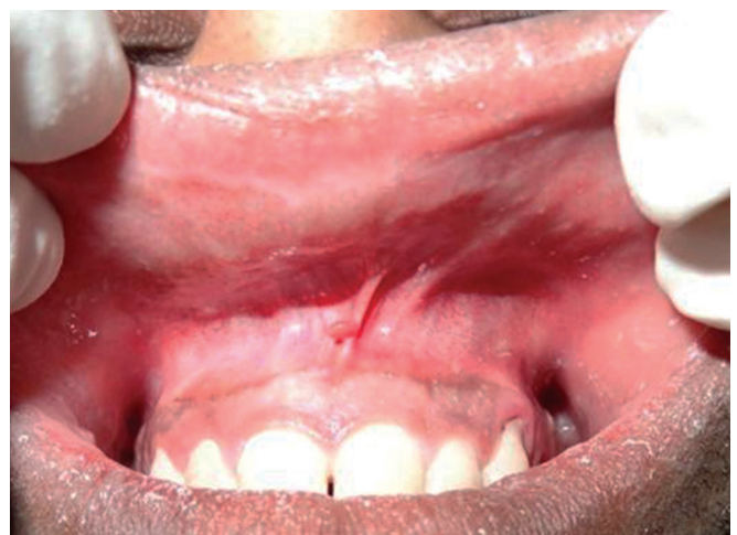
Fig. 2: Vestibular obliteration of left maxillary region