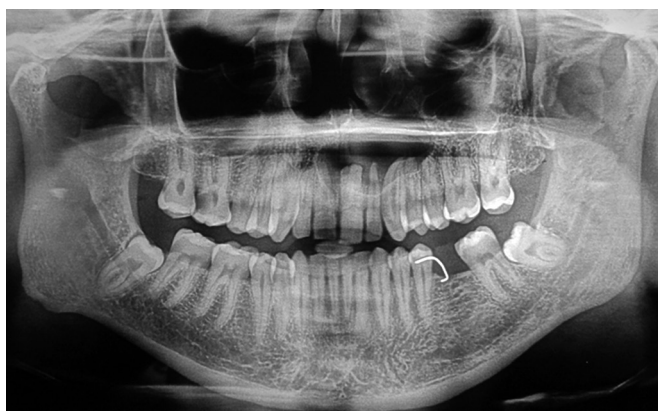
Fig. 3: Maxillary occlusal cross-sectional view showing radiolucency encircling an inverted supernumerary tooth

Radiographic appearance of dentigerous cyst is that of a well-defined pericoronal radiolucent lesion, which may be unilocular or multilocular in appearance. 7 In addition to its potential for bone destruction and because of the multipotential nature of this epithelium derived from the dental lamina, several entities may arise in or be associated