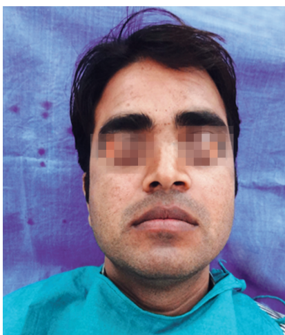
Fig. 1: Profile picture of patient

A solitary swelling measuring 5 × 3 cm was present on the anterior maxillary vestibular region extending from 21 to 24. Color of the overlying mucosa was similar to the surrounding normal mucosa. There was mild palatal expansion related to similar teeth. Clinical examination revealed a tender, firm swelling fixed to the alveolar process