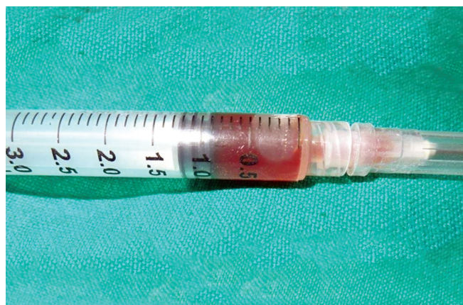
Fig. 6: Aspirate showing serosanguinous fluid