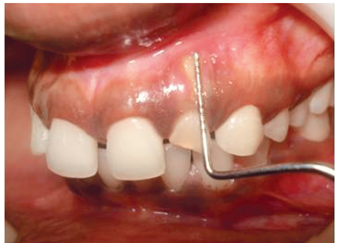
Fig. 1B: Preoperative height of the defect