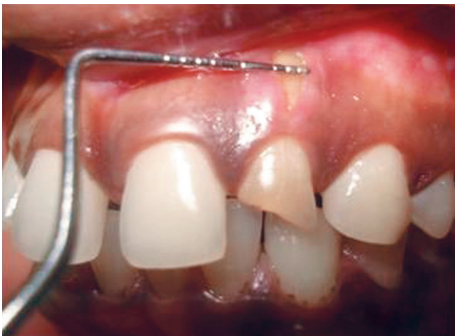
Fig. 1A: Preoperative width of the defect

A 22-year-old female patient reported to a private dental clinic in Chennai, India, complaining of discolored left upper front tooth with a tear in the gingiva. The patient was in good general health. Patient gave a history of a traumatic injury to the anterior tooth 2 years back and had undergone root canal treatment immediately following the injury. Clinical examination revealed a discolored and fractured 22 (Ellis and Davis Class III) with a perforated buccal cortical plate and a fenestration in the attached gingiva measuring 5 mm by 3 mm (Figs 1A and B). The tooth showed normal physiologic