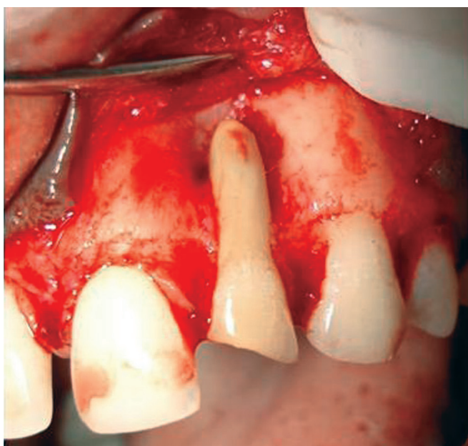
Fig. 2A: Osseous defect around the root apex of 22 after flap reflection and degranulation

circumscribing the root apex. Flap reflection was extended 2 mm beyond the root apex of the tooth. There was no cystic or granulomatous region in the root apex of 22. Mesial and distal interproximal bone in relation to 22 was intact with no crestal bone loss. The defect was completely debrided and decortication of the surrounding bone was performed using a round bur under copious irrigation (Fig. 2A). The root was demineralized using 24% ethylenediaminetetraacetic acid. Anorganic bovine bone mineral (BioOss™) was placed in the defect area to aid in bone regeneration (Fig. 2B). A resorbable collagen barrier membrane (Healiguide®) was placed over the bone graft and the exposed root surface and the flaps were approximated with interrupted sutures using 3-0 black silk (Figs 3A and B). The soft tissue defect was also