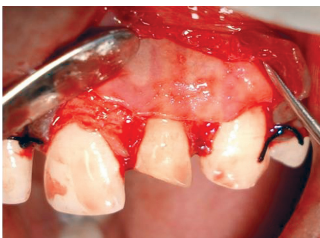
Fig. 3A: Resorbable collagen membrane placed over the bone graft in the defect site