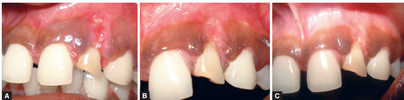
Figs 4A to C: (A) Ten days postoperative image at time of suture removal, (B) one month postoperative image showing satisfactory healing of the site and (C) three months postoperative image showing coverage of the soft tissue defect

sutured using 3-0 black silk. The patient was discharged after placement of a periodontal dressing (Coe-Pak). Post operative instructions included refraining from mechanical cleansing of the surgical site, which could disturb initial healing and to rinse with 0.2% Chlorhexidine gluconate solution (Hexidine, ICPA Health Care Products Ltd., Mumbai, India) twice a day for 1 minute. The patient was prescribed antibiotics (amoxicillin 500 mg t.i.d for 5 days) and anti-inflammatory/analgesic medications (ibuprofen and paracetamol combination t.i.d for 3 days). The wound healing was satisfactory without any local complications and suture removal was done after 10 days (Fig. 4A). The healing was uneventful. One month healing showed closure of the soft tissue fenestration defect with complete closure seen at 3 months (Figs 4B and C).