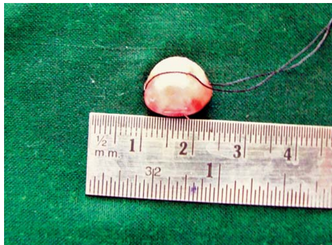
Fig. 5: Excised lesion of peripheral giant cell granuloma