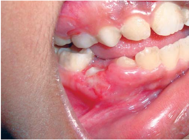
Fig. 6: Postoperative photograph shows uneventful healing after 7 days