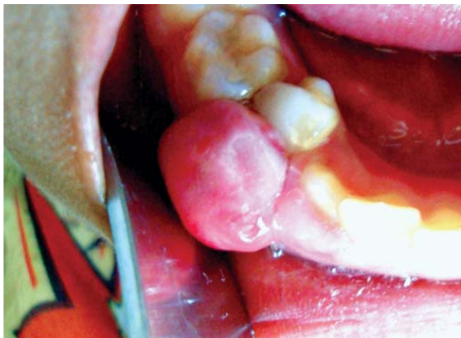
Fig. 2: Occlusal view of the lesion

The patient was referred to the Department of Pediatrics for hematological checkup. Hematological reports were within normal limits except hemoglobin (Hb: 8.7 gm%). The intraoral periapical radiograph did not reveal any pathological changes except for the natural resorption of the roots of mandibular right primary 1st molar.