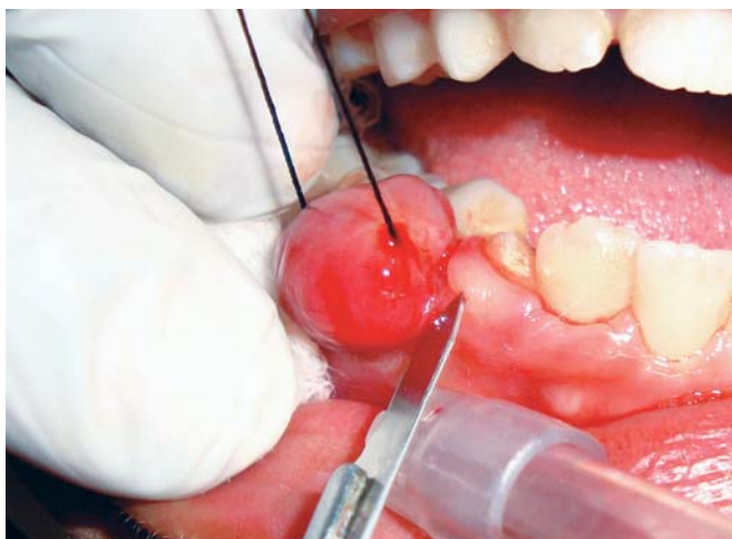
Fig. 3: Surgical removal of the lesion with scalpel

First of all oral prophylaxis and fluoride application was done. Then the lesion was surgically excised with its surrounding tissues by scalpel and curetted followed by extraction of the mandibular right primary 1st molar under local anesthesia in the same visit (Fig. 3). The bleeding was controlled by placing pressure gauze and abgel followed by analgesics medicine and postsurgical instructions were given to the patient as well the parents (Figs 4 and 5). The