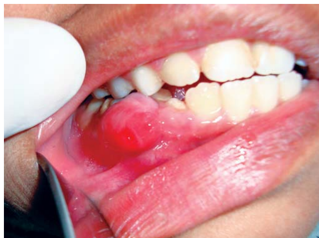
Fig. 1: Intraoral view of the lesion

Based on the history and clinical findings the following differential diagnosis was made: focal fibrous hyperplasia, PGCG and pyogenic granuloma. Then patient was advised for necessary radiographic and hematological investigation.