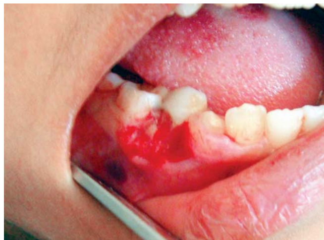
Fig. 4: Fresh bleeding after excision of the lesion

PGCG is seen in young as well as in the elderly population with highest incidence in 4th to 6th decades of life. 2,3 However, 20 to 30% of cases manifest in the 1st and 2nd decades of life. 4 The preferential location of the lesion according to Pindborg 5 is the premolar and molar zone, though Shafer 6 and Giansanti 4 suggest that it generally occurs in the incisor and canine region.