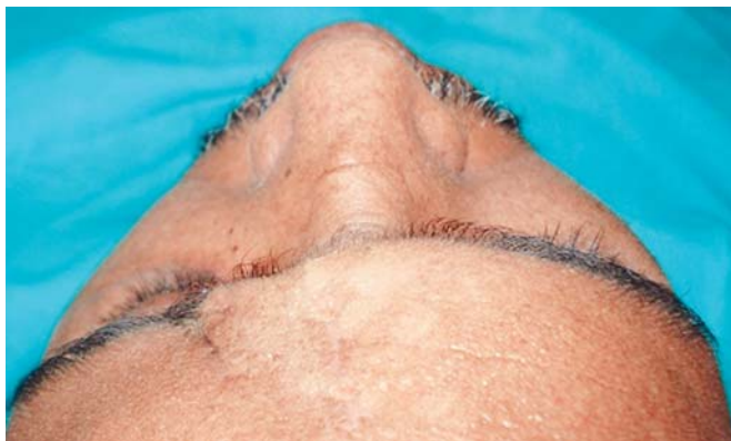
Fig. 1: Presurgical photograph