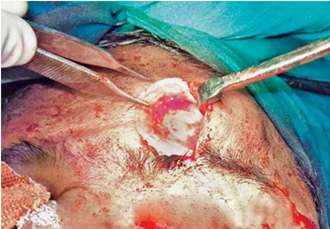
Fig. 5: Surgery-implant placement