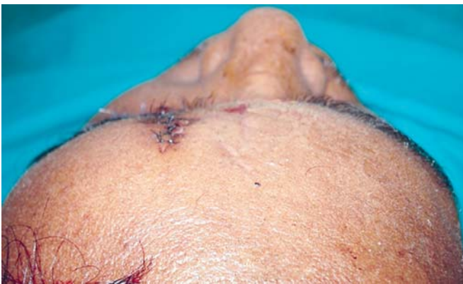
Fig. 6: Post-surgical photograph

suturing. The implant was anchored in position with an internal suture to the periosteum and the surrounding soft tissue, similar to the technique proposed by Barutcu. 7