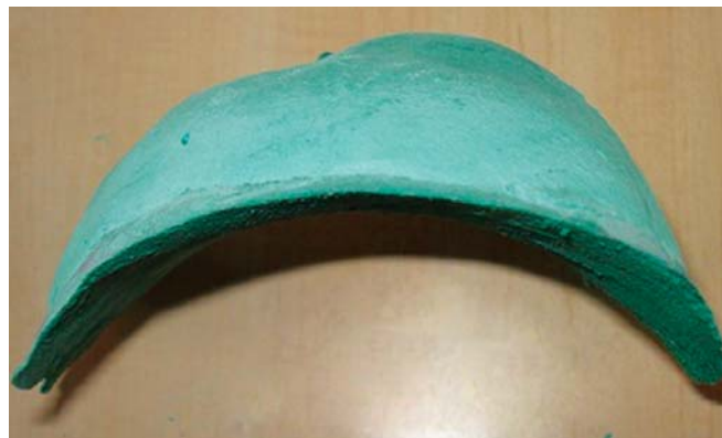
Fig. 2: Presurgical moulage

The prosthetic part involved in getting a facial moulage of the patient. The facial impression of the patient was made using irreversible hydrocolloid (Jeltrate).