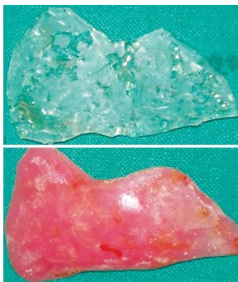
Fig. 4: Silicone-shaped like the stent

The surgical part was handled by the plastic surgeon. A vertical incision was made lateral to the defect, till the subperiosteal level. Subperiosteal tunneling was done on the area of the defect from the incision. The precontoured silicone implant was inserted and placed subperiosteally (Fig. 5). The contour of the forehead was checked before