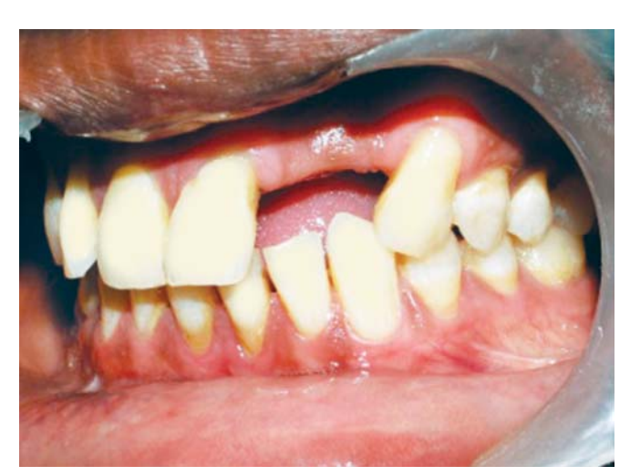
Fig. 1: Pretreatment view. Note mesial tilt in canine

A four-unit fixed design partial denture was planned with two modified ridge lap design lateral incisors as pontics connected rigidly with full coverage retainer on 23 and partial coverage retainer involving palatal surface on 21.