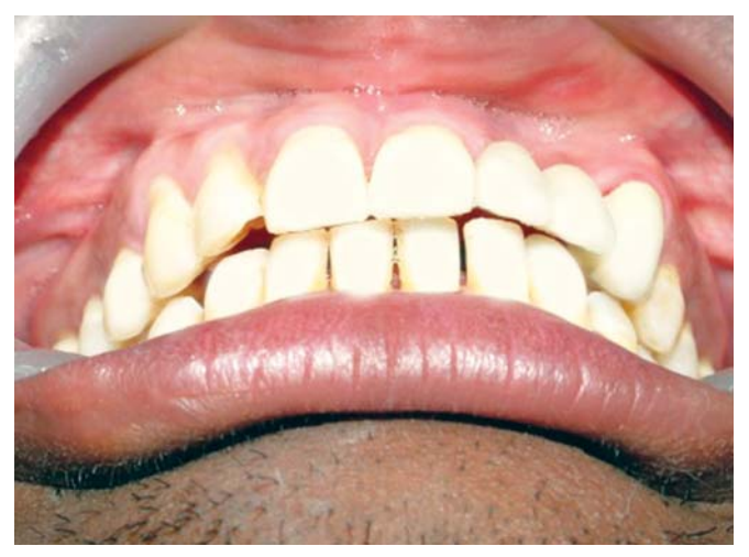
Fig. 4: Modified resin bonded bridge-Mary Lever

After this brief initial polymerization to secure the position of the restoration, it was firmly maintained in its definitive position, and polymerized with a 13 mm light guide (Optilux 500; Demetron/Kerr Corp.) for an additional