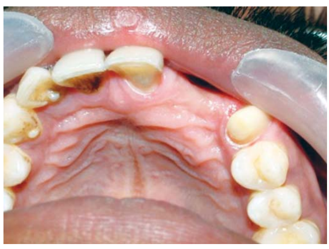
Fig. 2: Tooth preparation

The fixed prosthesis was fabricated in the laboratory with base metal alloys, due to their enhanced bond to resin cements and ceramic built over this framework with a layering technique. After fabrication of the restoration in the laboratory, the provisional restoration was removed the preparations were cleaned, rinsed and dried. The restoration fit was evaluated with an explorer and a silicone-based material (Fitchecker; GC America, Chicago, IL). The occlusion was evaluated with articulating paper (Arti-Fol