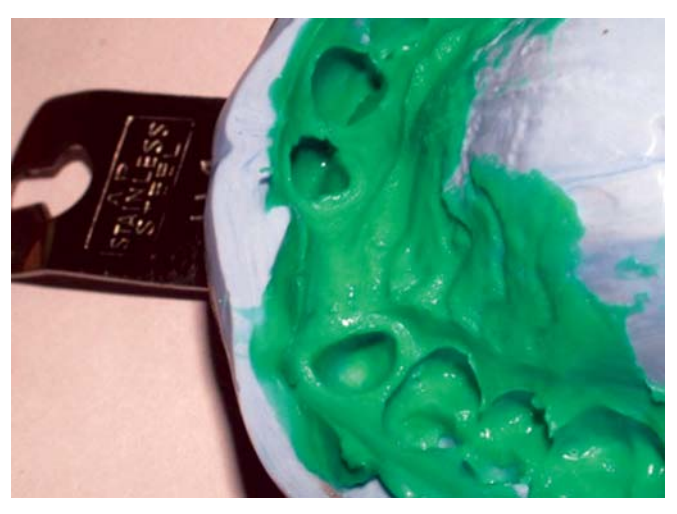
Fig. 3: Vinyl-polysiloxane impression

BK-25; Bausch KG, Koln, Germany) and adjusted. The esthetics was evaluated visually. Isolation with a rubber dam was performed, followed by luting of the restoration by use of an adhesive technique.<sup>4</sup>