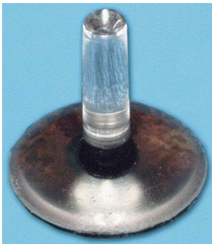
Fig. 5: Ocular button