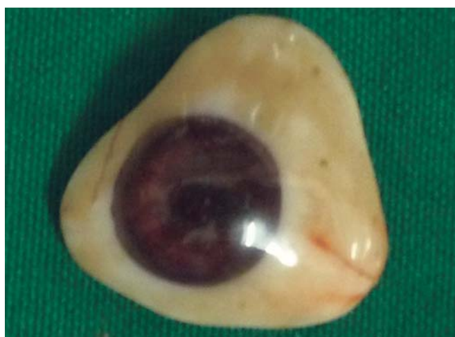
Fig. 7: Characterization of the sclera

Post-insertion instructions included regular removal and cleaning of the prosthesis with an ophthalmic irrigation solution. 4