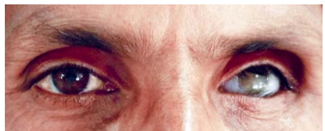
Fig. 1: Previous stock ocular prosthesis

A 5 ml disposable syringe without the needle was used to record the defect using irreversible hydrocolloid impression material (Fig. 2A). The impression obtained was invested in a small bowl of dental stone (type III gypsum product) (Fig. 2B). From the cast obtained, a custom tray was fabricated with clear acrylic (Fig. 2C, Inset). This tray was adapted to the tip of an elastomeric automixing syringe.