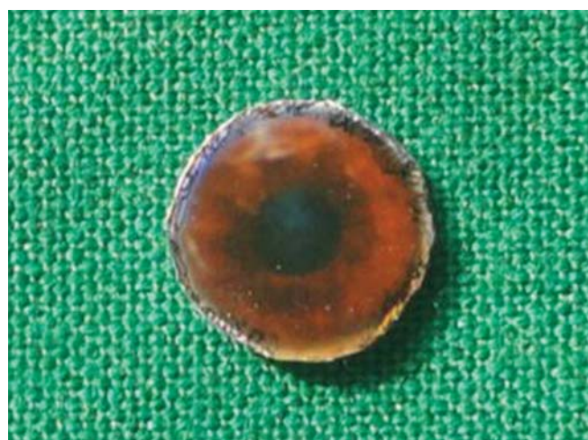
Fig. 4: Iris printed on photo paper

along the shape of the iris and coated with cyanoacrylate to make it water resistant (Fig. 4).