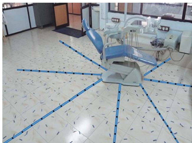
Fig. 2: Dental chair surrounded with litmus papers

range of 2.1 to 7.4 which on contacting the blue litmus paper will turn it into red.