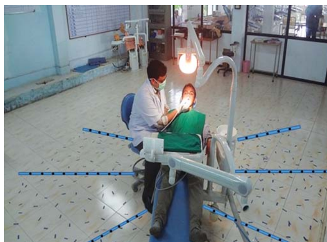
Fig. 3: Airtor working

Hall has classified the space zones which people (consciously or unconsciously) maintain from each other during common social activities as intimate (0-45 cm), personnel (60-120 cm), social (1.2-3 m), and public (over 3 m). 10 Distance always played a significant role in social