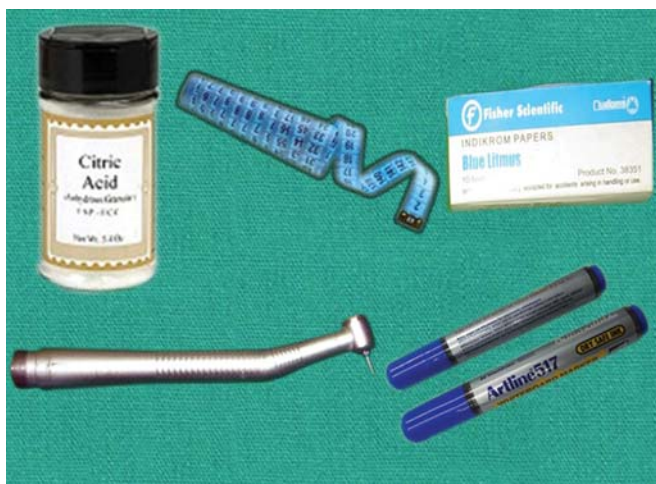
Fig. 1: Materials used in the study