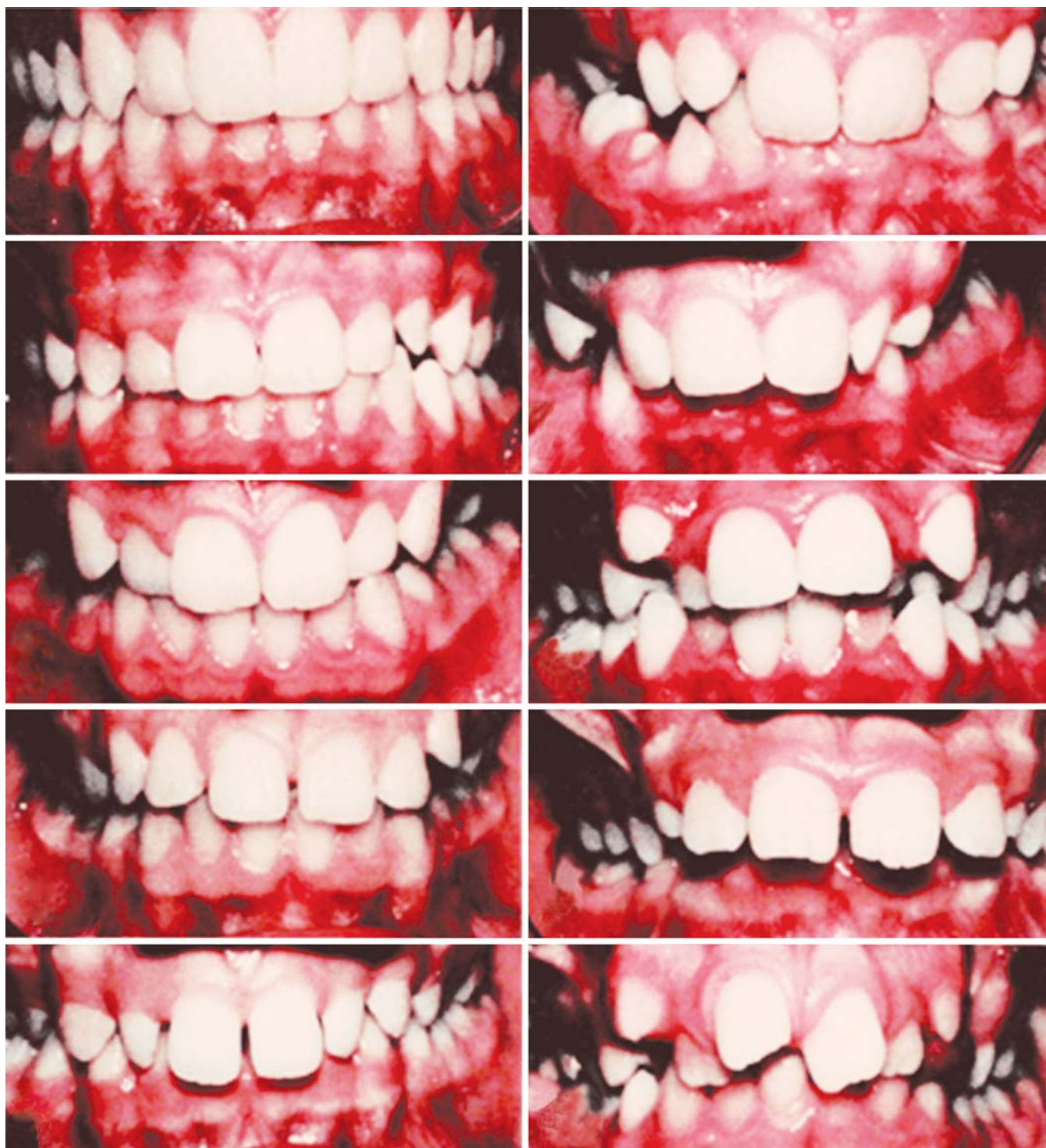
Fig. 1: The esthetic component of orthodontic treatment need