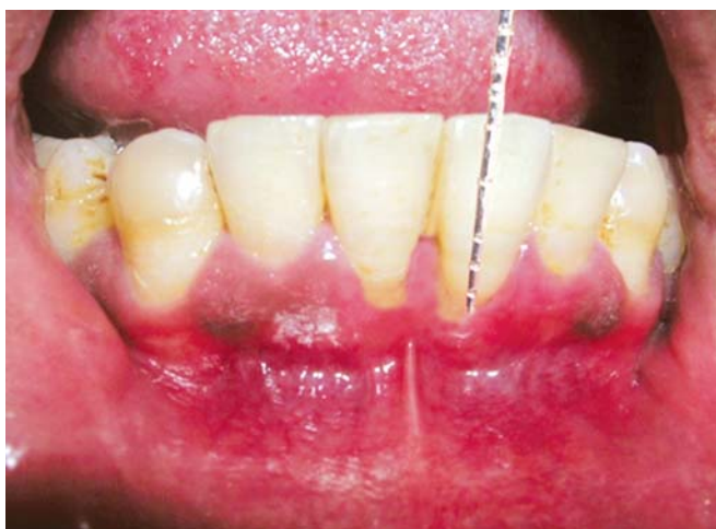
Fig. 7: Preoperative view