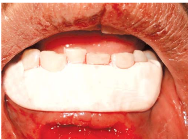
Fig. 4: Periodontal pack placed

keratinized gingiva was 2 mm. A PPD of 2 mm and CAL 4 mm was present (Figs 7 to 10).