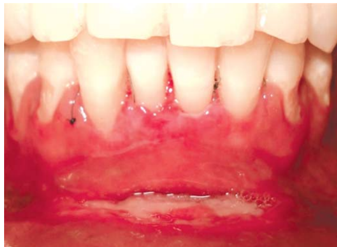
Fig. 5: Ten days postoperative photograph