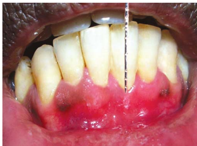
Fig. 10: Three months postoperative photograph