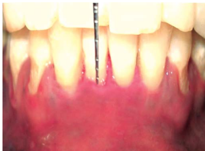
Fig. 6: Three months postoperative photograph