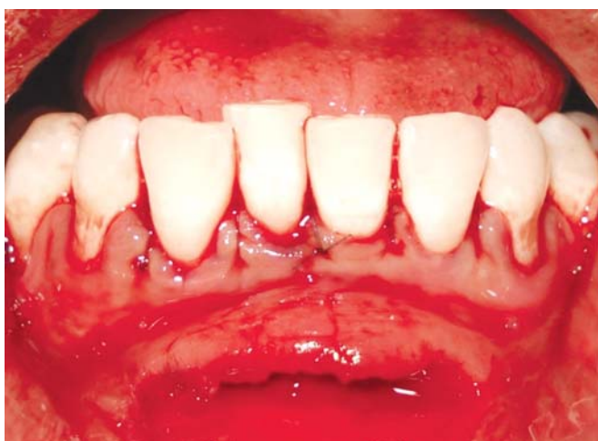
Fig. 3: Coronally positioned and sutured