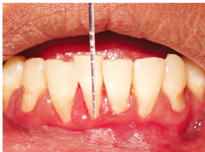
Fig. 1: Preoperative view

A 26-year-old male patient revealed the following on intraoral examination: Deep narrow gingival recession (Sullivan and Atkins 1968) was present on 31, 32, 41, 42. The width of recession 2 mm and depth of recession was 3 mm and width of keratinized gingiva was 3 mm. A PPD of 2 mm and CAL 5 mm was present (Figs 1 to 6).