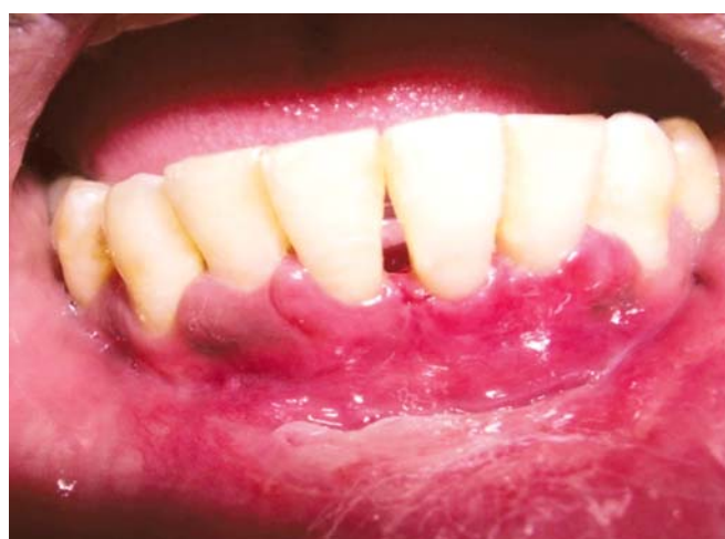
Fig. 9: Ten days postoperative photograph