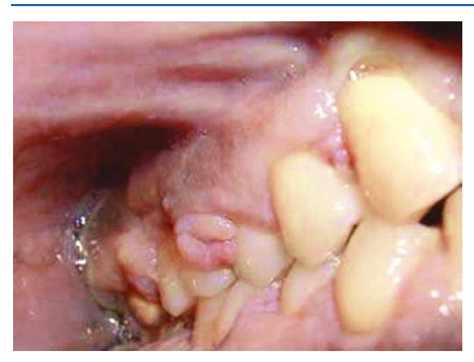
Fig. 3: Drug-induced gingival enlargement