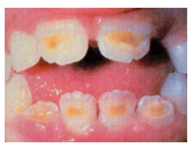
Fig. 2: Enamel hypoplasia

Oral candidiasis will affect 20 to 30% transplant patients. <sup>18,19</sup> Candidal infection may present as angular cheilitis, pseudomembranous or erythematous ulceration or chronic atrophic infection. <sup>11</sup> Prevention is effective in the early post-transplant period with antifungal lozenges or solutions.