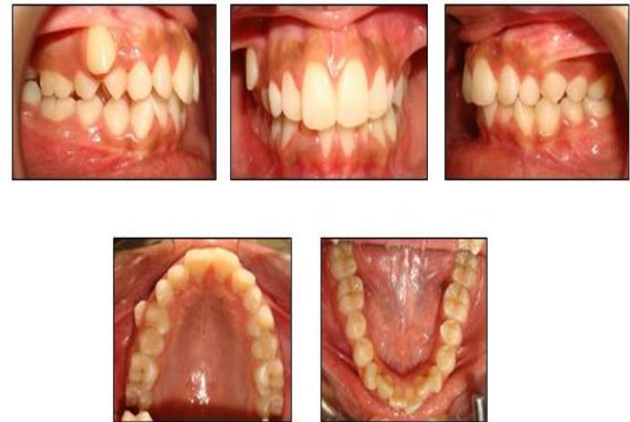
Figure 2: Pre-treatment intra-oral photographs

including the 3rd molars were present with complete bilateral transposition of maxillary canines and 1 st premolars (Fig 3).