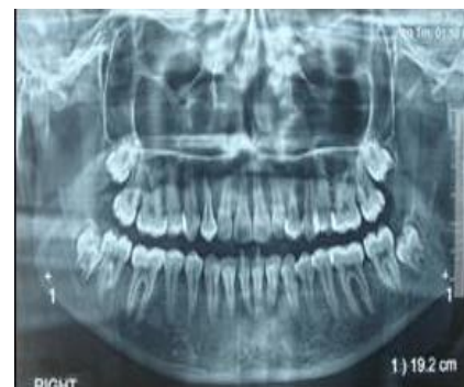
Figure 7: Post-treatment OPG shows finishing in transposed position