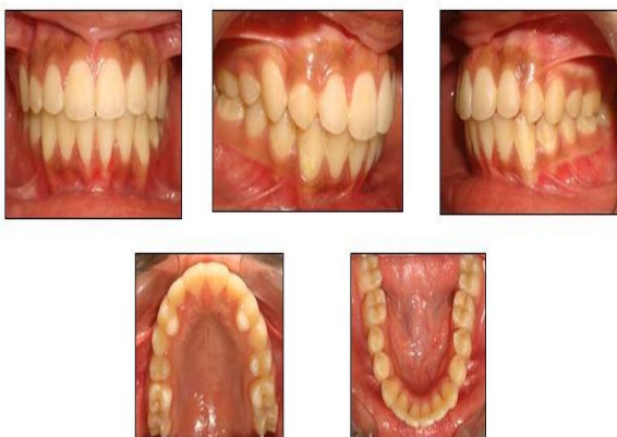
Figure 5: Post-treatment intraoral photographs

The challenge of correcting a transposition is to accomplish it while maintaining periodontal health. The