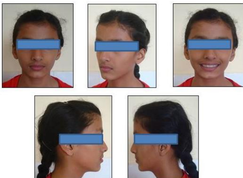
Figure 1: Pre-treatment extra-oral photographs

The patient, a girl aged 13 years, reported to the Department of Orthodontics, with the chief complaint of mild crowding along with tooth malposition in upper arch. An extraoral examination showed a pleasing face with facial symmetry and a straight profile (Fig 1). An intraoral examination revealed that she had all her permanent teeth erupted except maxillary left canine which had not erupted. There were bilateral retained deciduous maxillary canines present.