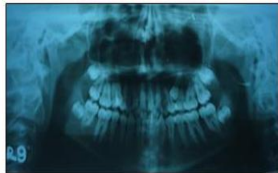
Figure 3: OPG showing complete bilateral maxillary transposition between canine & 1 st premolar

Treatment objectives were based on multidisciplinary approach to improve esthetics, establish oral health and function as well as to attain stability forms. The patient was referred for the required orthodontic treatment with the aim of achieving treatment objectives mentioned below: