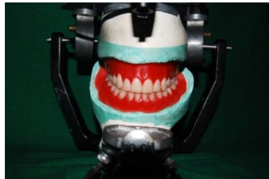
Fig 2-Teeth arrangement for conventional denture on semi adjustable articulator.