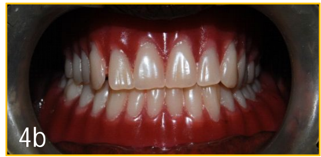
Fig-4a and 4b comparison between conventional and characterized denture.