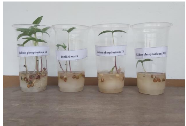
Figure 2: Day 7 of experiment