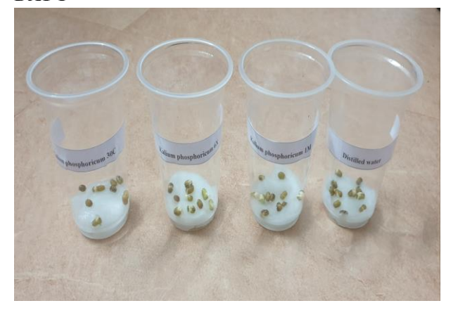
Figure 1: Day 1 of experiment