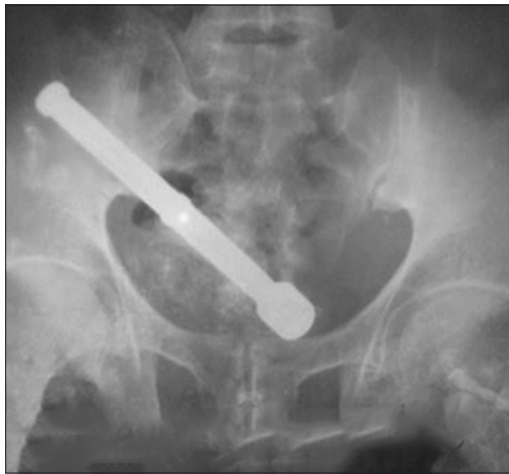
Figure 2: X-ray pelvis with metallic foreign body

efforts removal was not possible. After pre-operative intravenous antibiotics, the patient was brought to the operating room, where he was given general anesthesia and intubated, and placed in the supine position. Laparotomy was done and peritoneal cavity was reached. Hard metallic object could be palpated in rectum and sigmoid colon with no features of perforation. An enterotomy was made on anterolateral wall of sigmoid colon and a 20 cm metallic rod was removed (Figs. 3 and 4). Enterotomy was primarily closed in double layer after extraction of foreign body. Abdominal drain was placed and laparotomy was closed. Post-operative period was uneventful. Drain was removed on postoperatively day 2, and the patient was referred to psychiatrist after being discharged.