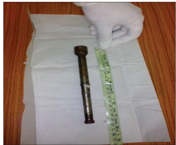
Figure 4: Metallic pestle postoperatively

of the foreign body which will lead to the lax rectal sphincter. According to Danielson and Holmes [7], 8% of adolescent youths suffer from sexual abuse.