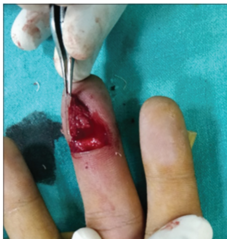
Figure 3: Careful exploration and successful removal of the retained broken needle tip

suspected foreign body begins with a careful history and physical examination [1-3,5]. History should include the exact mechanism of injury, specific timing and nature of the injury, and the level