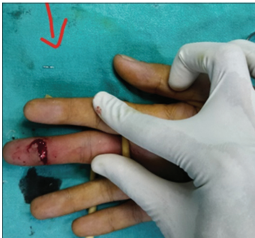
Figure 2: Surgical exploration under digital block with tourniquet (rubber catheter) control; broken sewing machine needle tip lying by the side of finger