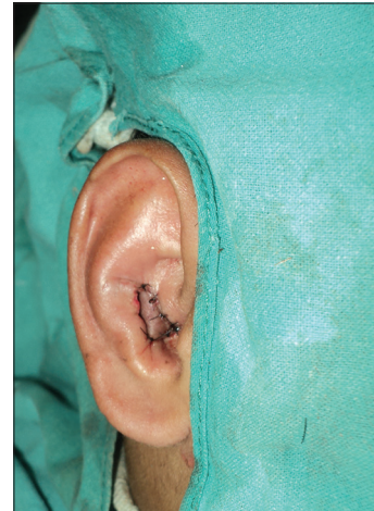
Figure 5: Conchal reconstruction with good aesthetic outcome [anterior view]