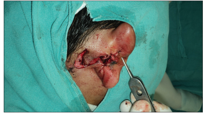
Figure 4: Conchal reconstruction with superiorly based retroauricular flap [posterior view]; Flap elevation