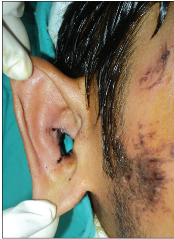
Figure 1: Bluetooth device injury induced full thickness conchal defect