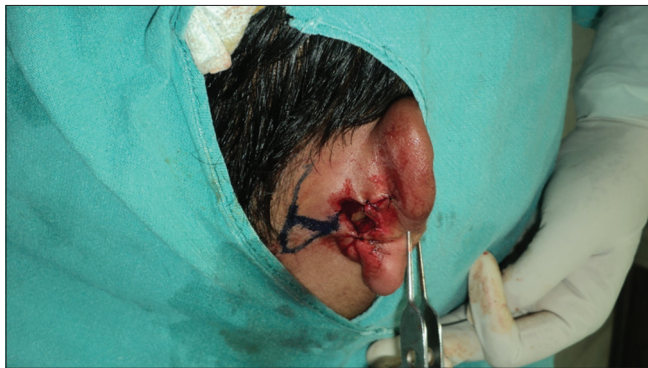
Figure 3: Conchal reconstruction with superiorly based retroauricular flap [posterior view]; Flap marking