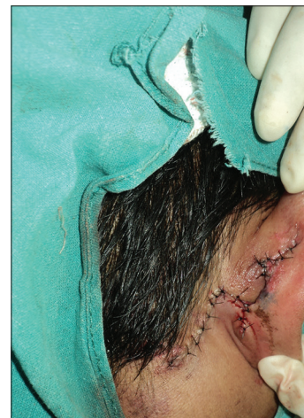
Figure 6: After flap inset post operative [posterior view]

group was bite injuries (22%) followed by traffic accidents (17%) and burns (9.5%). In this study as well, Bluetooth device injury was not the etiology of ear injury [2].