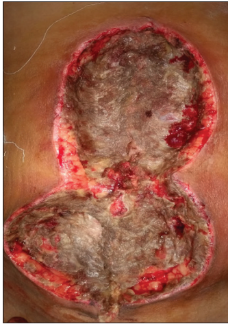
Figure 1: Gangrenous changes in the subcutaneous tissue and rectus sheath