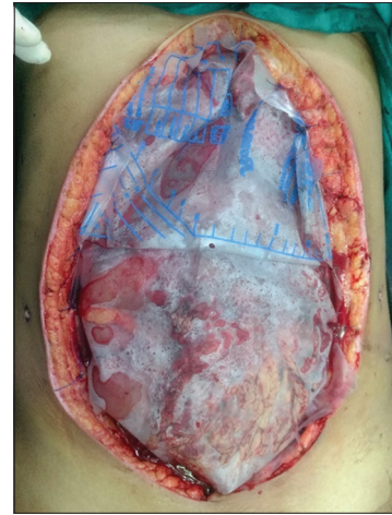
Figure 3: Bogota bag applied for wound closure

Necrotizing fasciitis is a rare disease with an incidence reported to be between 500 and 1500 cases per year in the United States. It is a life-threatening, soft-tissue infection characterized by rapidly spreading inflammation and necrosis of the skin, involving the subcutaneous tissues and fascia due to the spread of the bacteria among and inside the skin surface [1]. Historically, necrotizing infections were classified according to anatomical sites. Fournier's gangrene (involving the scrotum and perineum) and Ludwig's angina (involving submandibular and sublingual spaces) and Meleney's synergistic gangrene (involving abdominal wall) are examples. These infections were named after the physicians who first described them [2]. In 1952, the term "necrotizing fasciitis" was proposed by Wilson, as a more accurate description of this disease [3].