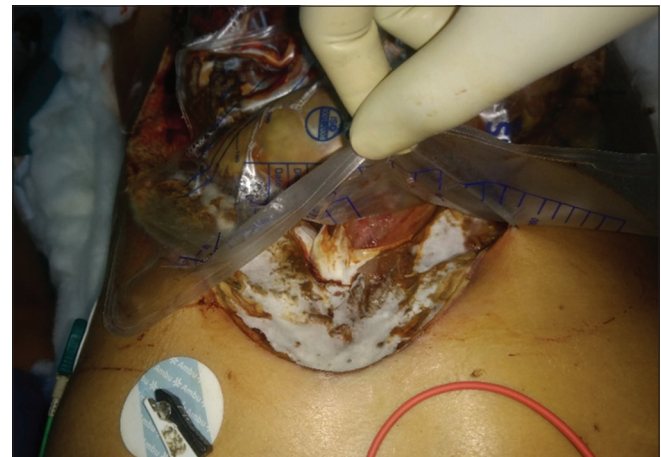
Figure 4: Photograph showing growth of fungal colonies on the debrided wound

Meleney's ulcer or post-operative synergistic bacterial gangrene is the term given to a rare form of necrotizing infection of the abdominal wall which develops following intra-abdominal surgery in the immediate vicinity of the surgical wound. It is caused by synergistic interaction between microaerophilic non-hemolytic Streptococcus and hemolytic aerobic S. aureus [4].