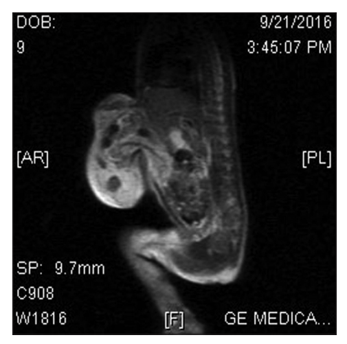
Figure 3: Bowel loops were seen communicating on both the sides with blood vessel signals were also there