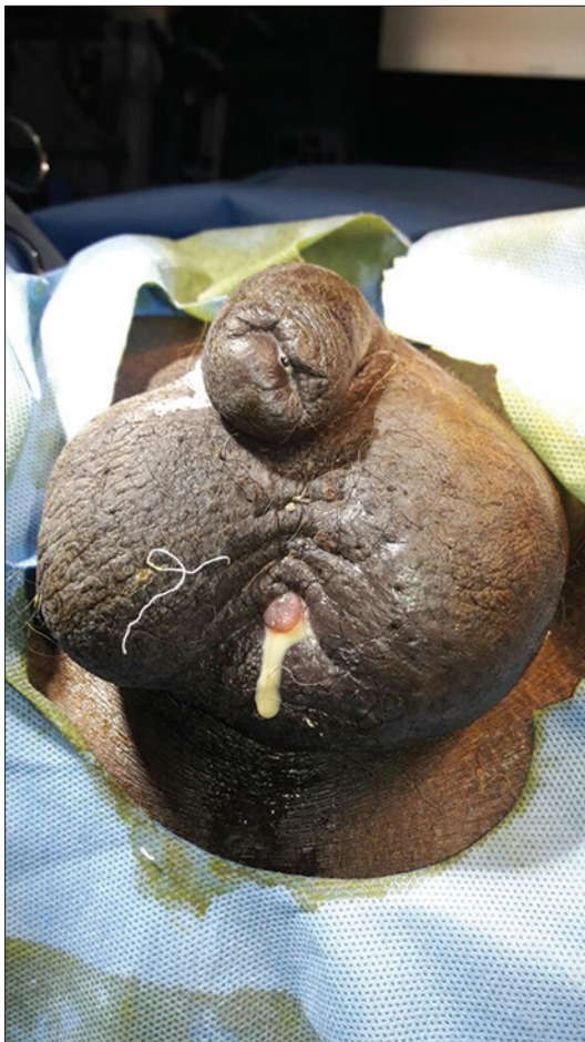
Fig. 2 Local Examination showing urethra-cutaneous fistula and pus discharge.