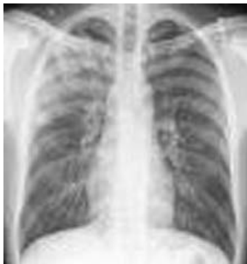
Figure 1 - Chest X-ray suggestive of Right Upper Lobe Pneumonia

On examination, his vitals were within normal limits (pulse rate - 95/min, blood pressure - 132/86 mmHg and respiratory rate - 25/min, SpO 2 - 90% on room air). There was no pallor, icterus, clubbing, edema or lymphadenopathy. Respiratory system examination showed rales in right mammary and axillary areas. Rest of systemic examination revealed no significant abnormality. His fasting blood sugar was 121 mg% and post-prandial sugar was 179 mg%, HbA1c was 8.1%. His total leukocyte counts were 12,300 cells/mm 3 (82% were polymorphs) and normal platelet counts. Chest X-ray was suggestive of right upper lobe pneumonia (Fig 1).