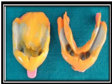
Figure 7 - Final Impressions (elastomeric impression material) taken

using stock tray (Fig. 5). The retained teeth selected as an abutment were modified or restored and endodontically prepared. Maximum reduction of coronal portion of the tooth was accomplished. A better crown to root ratio was established.