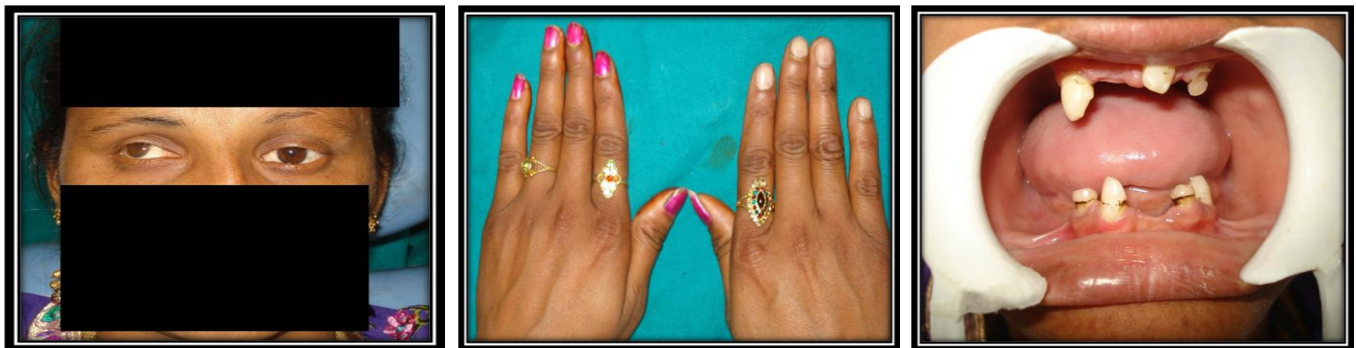
Figures: Figure 1 - Frontal view of patient showing defect in right eye. Figure 2 - Normal finger nails. Figure 3 - Pre-operative view showing partial anodontia

Orthopantomogram (OPG) was done to determine the amount of remaining bone and individual radiographs (IOPA) were done to determine the prognosis of teeth present in the oral cavity. It was observed that only basal bone had developed and the alveolar processes were almost completely deficient (Fig. 4). Four teeth had poor crowns and exposed pulps. Analysis of articulated casts and full mouth radiographs determined the potential abutment teeth restoration and endodontic requirement in the context proposed over denture design.