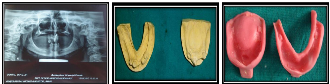
Figures: Figure 4 - Orthopantomogram showing poorly developed alveolar processes. Figure 5 - Diagnostic casts prepared. Figure 6 - Custom trays prepared.

Removable prosthodontics is the most frequently used treatment modality for the dental management of patients with ectodermal dysplasia. Because of anodontia or hypodontia in ectodermal dysplasia, complete partial-dentures or over-dentures (tissue or implant - supported)