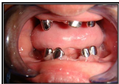
Figure 9 - Copings placed in the mouth

Tooth preparation included combination of shoulder and chamfer gingival margins as dictated by the amount of residual tooth structure. Secondary impressions were made by utilizing custom trays and elastomeric impression material (Fig. 6 & 7). The cast copings were fabricated to