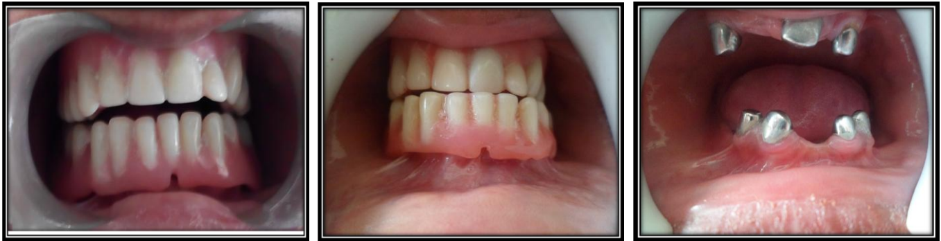
Figures: Figure 10 - Final denture delivered. Figure 11 – One year post-operative. Figure 12 - One year post-operative

Certain genetic studies (more than 300 cases) have revealed X-linked inheritance with its gene locus being Xq11-21.1 and gene is carried by female but is manifested in males. However, females are also affected in some cases because of Lyon hypothesis [7]. According to this hypothesis, there is inactivation of one X-chromosome due to which there is one normal gene and one abnormal gene. Hence, females with reduced number of teeth and mild structural changes are also observed as in this case.