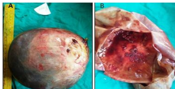
Figure 1 A: A large globular mass measuring 20 x 8x7 cm and weighing 2.3 kg. External surface was grey-yellow, smooth and glistening. B: On cut section, the mass was entirely cystic, uniloculated. Some areas of cyst wall were thickened, grey-white and firm in consistency. Internal surface of cyst showed reddish brown friable blood clots.

Gross examination revealed a large globular mass ( fig. 1 ) measuring 20x8x7 cm and weighing 2.3 kg. External surface was grey yellow, smooth and glistening. On cut section, the mass was entirely cystic, uniloculated and filled with two litres of haemorrhagic reddish brown fluid. Some areas of the cyst wall were thickened and grey white firm in consistency. The internal surface of the cyst showed reddish brown friable blood clots. The uterus and cervix with bilateral adnexa were unremarkable.