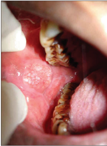
Figure 1: Intraoral photograph of lesion