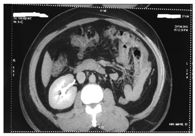
Figure 2: Dilated left ureter