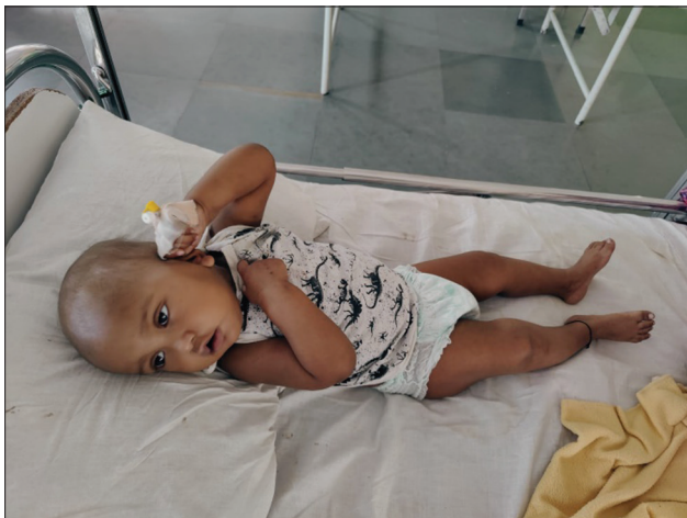
Figure 1: A child with infantile tremor syndrome

Abnormal movement of hands, eyes, and tongue need not always