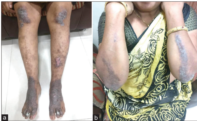
Figure 1: Dark patches of hyperpigmentation, with hyperkeratotic scaly plaques on the extensor aspects of the (a) forearms and (b) legs 2 months after starting arsenic

Peripheral neuropathy may be the first sign of chronic arsenic toxicity. It is predominantly due to axonal destruction or axonopathy. Early electrodiagnostic features are indistinguishable from Guillain-Barre syndrome and it later evolves into a more classic sensorimotor distal axonopathy. Moderate poisoning often presents with painful dysesthesias and other sensory effects, whereas, severe poisoning presents with ascending weakness and paralysis. There is rarely any involvement of cranial nerves even in severe poisoning. Hyperpigmentation and hyperkeratosis are delayed hallmarks of chronic arsenic exposure. This is often accompanied by anemia. Lung cancer and skin cancer are serious long-term complications among cases of chronic arsenic poisoning [2]. Recovery from neuropathy induced by chronic exposure to arsenic compounds is generally slow, sometimes taking years, and complete recovery may not occur. Studies suggest that the use of Vitamin A analogs (retinoids) may be