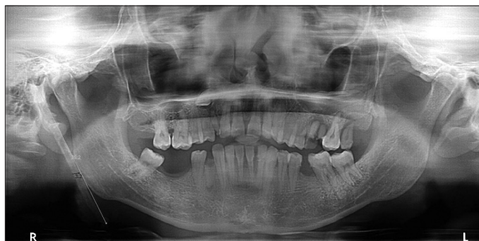
Figure 1: Panoramic radiograph showing unusually elongated styloid process of the right side

The styloid process is a part of the styloid complex which also consists of styloid ligament and stylomandibular ligament. The normal length of the styloid process in adults ranges between 20 and 25 mm. When the length of the styloid process exceeds above 30 mm, it is considered to be elongated. Elongation of the styloid process was first described by Eagle. It is usually identified in the 3 rd -4 th decades of life and there is no gender predilection [1]. Due to its anatomical relation with the external, internal carotid artery, and facial nerve, it can produce pain in the neck and cervicofacial region resembling glossopharyngeal neuralgia, dysphagia, tinnitus, and otalgia which is described as Eagle's syndrome [2]. An elongated styloid process can also cause damage to the carotid artery resulting in cerebrovascular complications caused due to carotid artery dissection or thromboembolism [3]. Only 4% of patients with elongated styloid process presents with symptoms. Panoramic radiograph is the most routinely employed imaging technique for the maxillofacial region and can be used as the method for evaluation of the elongated styloid process. If