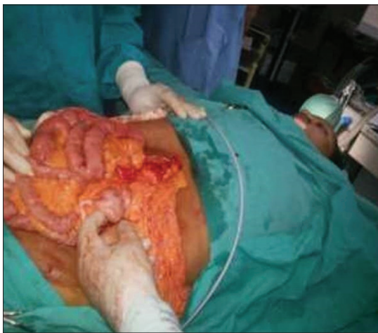
Figure 2: Cecum found at the left iliac fossa

After discussion in the MDT, he was started on adjuvant FOLFOX (5 FU, oxaliplatin, and leucovorin combination chemotherapy). For Grade III toxicity after the third cycle, he was put on three more cycles of capecitabine and oxaliplatin chemotherapy (CAPEOX). He has been on regular follow-up since then and remains well after 5 years from the time of surgery.