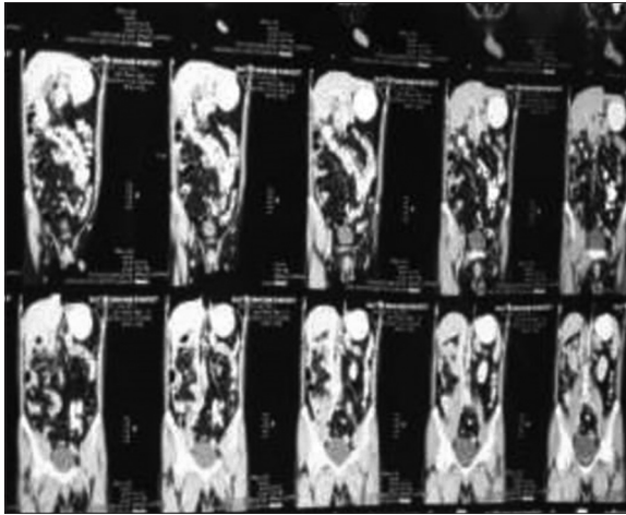
Figure 1: Contrast-enhanced computed tomography scan showing caecum in the left side of the abdomen