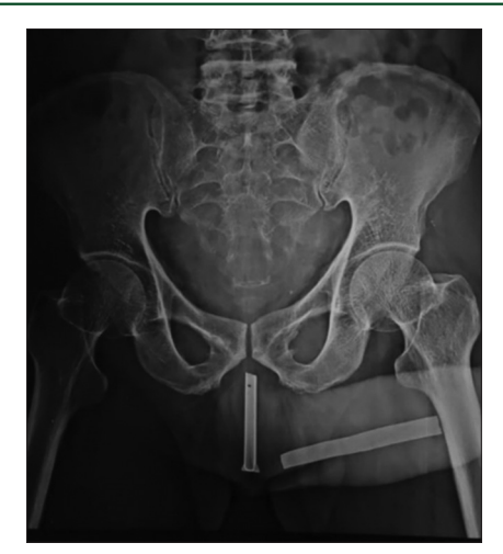
Figure 1: Plain X-ray of pelvis showing two long radio-opaque foreign bodies in the male urethra