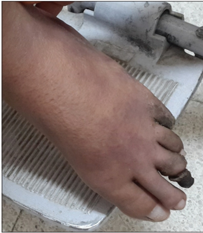
Figure 1: Dry gangrene of the left third toe involving the nail bed and the plantar aspect of the foot and darkening of the left fourth and fifth toes involving the nail beds

with the left third toe, and the temperature of her left foot was lower than that of the right one. The radial, brachial, femoral, and dorsalis pedis pulses were palpable. Other systemic abnormalities or positive findings were not found on physical examination. As the patient had a complaint of backache, the local examination of the spine was done, but it did not show any curvature or deformity, and the skin overlying the spine was normal.