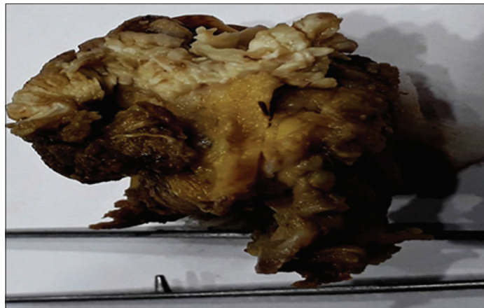
Figure 1: Gross appearance of verrucous carcinoma of the buccal mucosa

VC was first described by Ackerman in 1948 [1]. Association of VC with dysplasia/minimal invasion was studied by several authors. Medina et al. , in 1984, studied 104 cases of VC and reported that 20% of VC is associated with less differentiated SCC, and the local recurrence was slightly higher than pure VC, but none of those tumors had nodal metastasis [2]. Batsakis and Suarez in the year 2000 coined a term hybrid VC for those in which pure VC associated synchronously with