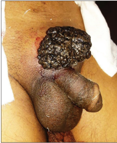
Figure 1: Gross picture showing a skin covered blackish brownish polypoidal mass having cerebriform appearance with fissures and ridges