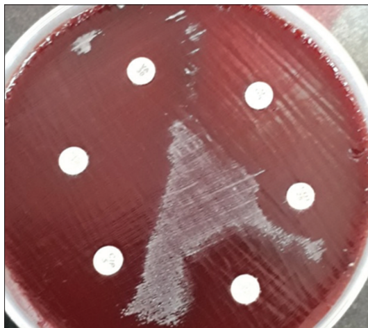
Figure 3: Antibiotic susceptibility testing on blood agar by Kirby-Bauer disc diffusion method