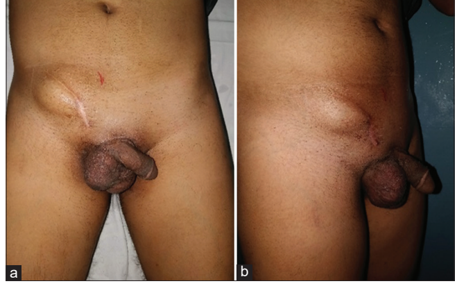
Vol 6 | Issue 2 | Feb 2020