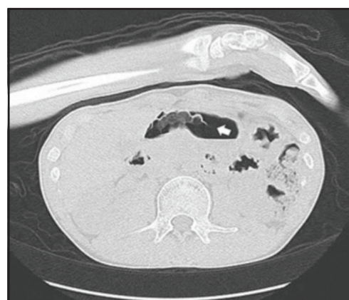
Figure 1: Abdominal computed tomography (CT) on presentation intratransverse cross-section. The arrow shows a 7-cm mouthguard-shaped foreign object in the stomach.

Several failed attempts were made to remove the foreign object with grasping forceps and a snare. However, although it could be withdrawn from the stomach, its large size and curvature prevented its passage through the gastroesophageal junction. Attempts were then made to remove the object by attaching a skirt-shaped hood (D-Y0001-02, Olympus, Tokyo, Japan) and