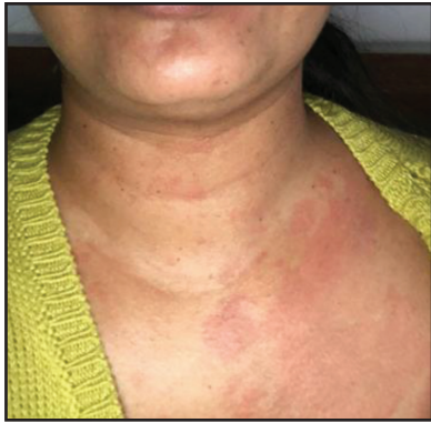
Figure 2: Maculopapular rash on the body.