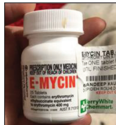
Figure 1: Erythromycin ethyl-succinate.

The patient was immediately put on oxygen through an oxygen mask and intramuscular injection of 0.5 ml of adrenaline (1:1000) was given followed by slow intravenous injection of chlorpheniramine (20mg), over 1 minute. Slow intravenous