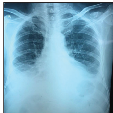
Figure 1: X-ray chest showing bilateral blunting of costophrenic angle.

On examination, his vitals were stable. His blood pressure was 126/78mmHg, pulse rate was 76/min regular and respiratory rate of 18/min. General physical examination was inconclusive. Presently, there were no tender swollen joints or any subcutaneous nodule. Respiratory examination revealed decreased bilateral air entry in infra-scapular and infra axillary area with stony dullness on percussion and fine end-inspiratory crackles.