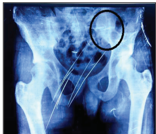
Figure 1: Left grade II sacroiliitis.

The patient was treated with intravenous ceftriaxone 2gm twice daily and intravenous azithromycin 1gm daily. The patient