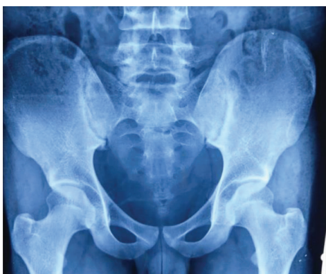
Figure 3: Repeat X-ray Pelvis after completion of treatment.

Hence, the patient was diagnosed as a case of enteric fever with abdominal lymphadenopathy with iliacus muscle collection (possibly abscess) with probable typhoidal sacroiliitis. The patient was continued on intravenous antibiotics for 2 weeks and later switched over to oral antibiotics for the next two months. One month after the presentation, the patient recovered clinically and was pain-free with no limitation of movements or tenderness. A repeat X-ray Pelvis after completion of treatment was normal