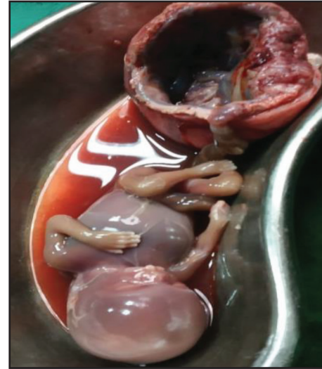
Figure 3: Excised rudimentary horn with fetus

Pregnancy in a non-communicating rudimentary horn occurs as a result of transperitoneal migration of either the spermatozoa or the fertilized ovum, which then enters the contra lateral tube and implants in the rudimentary horn [10]. Tsafirir et al reported