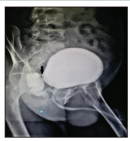
Figure 2: MCU 1- arrow showing colovesical fistula in right Posterolateral side

weeks. After a course of mesalamine and ciprofloxacin 500mg for 5 days according to urine culture, the patient improved symptomatically. On followup at 4 weeks and 8 weeks, the patient was symptom-free, he was advised further radiological test to confirm resolution of colovesical fistula but he denied. He is on clinical surveillance since last 2 years and has not shown annny symptoms of the disease.