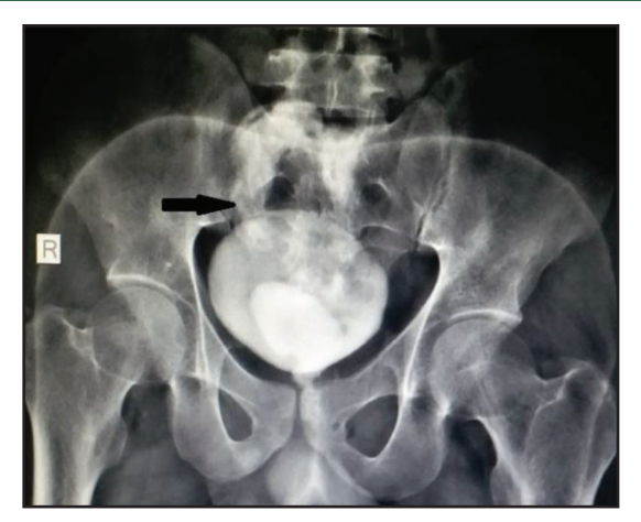
Figure 3: MCU 2- Showing Colovesical Fistula

There are few reports of medical management for colovesical fistula. Amin et al [10] managed 6 patients of colovesical fistula on intermittent antibiotic therapy alone, without any significant complications. Similarly, Solkar et al [11] retrospectively studied six patients who declined surgical intervention. They were managed conservatively and did not exhibit urosepsis or significant changes in renal function. In this case report also, the complete resolution of the fistula was not documented. In our case report, the patient was started on mesalamine and ciprofloxacin therapy as the patient refused to go for the surgical intervention. The patient improved symptomatically with medical management and is under surveillance since 2 years. But longer surveillance is required to ascertain the success of medical management in the treatment of colovesical fistula.