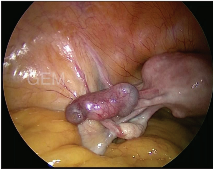
Figure 1: Intraoperative finding of the left fallopian tube with primary fallopian tube carcinoma

ovaries were normal. Left tube was enlarged in size (3 x 2 cm), which was suggestive of hydrosalpinx (Fig. 1).