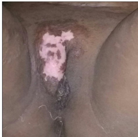
Figure 3: Vulval ulcer after 3 months of treatment antituberculosis therapy