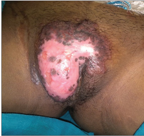
Figure 1: Vulval ulcer before treatment