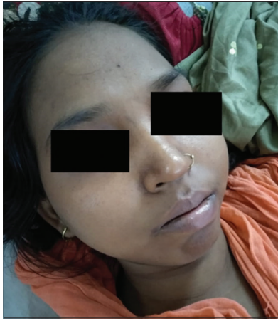
Figure 1: Diffuse macular reddish rash present over the face of the patient

enhancement margins were ill-defined with multiple non-enhancing hypodense areas suggestive of necrosis which were seen in the body and tail region (>30% necrosis). Extensive stranding of the peripancreatic, mesentery, omental, and perigastric fat planes is noted with edematous bowel loops and was suggestive of acute necrotizing pancreatitis with CT severity index of 10/10 (Fig. 2).