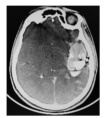
Figure 2: Dyna computed tomography showing intracerebral bleeding

paralyzed, we were unable to document the Glasgow Coma Scale. After repeat head CT, considering the expanding intracerebral hematoma, urgent neurosurgical consultation was sought and emergency decompression in operation theater (OT) was planned. The patient's relatives were explained about the intraprocedural complication and further necessary management. The consent for the procedure was obtained from the relatives. The patient was shifted to OT immediately and received 1.2 g loading dose of injection fosphenytoin.