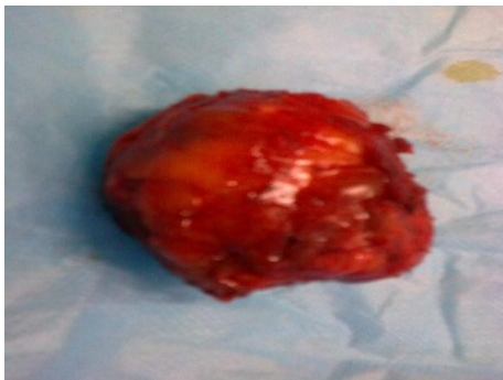
Figure 3 - Excised specimen