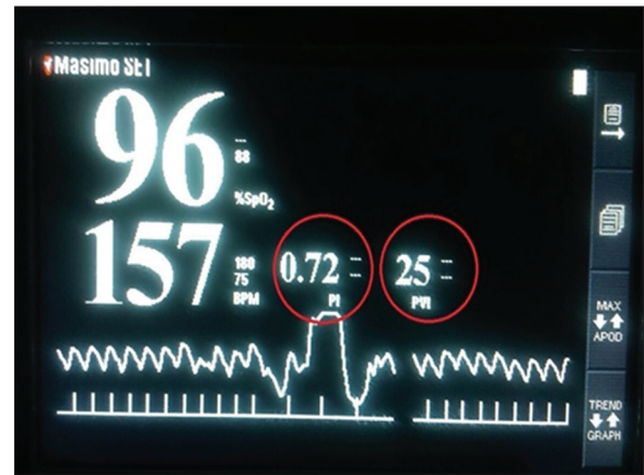
Figure 1: Perfusion index and Pleth variability index displayed in pulse oximetry